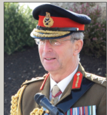
Lord Richards of Herstmonceux