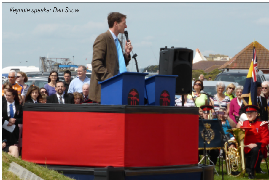
Keynote speaker Dan Snow

As ever, we enjoyed fine weather. It is quite remarkable that on every public occasion, from the delivery of the granite centre-piece by 24 Regiment Royal Engineers in July 2012, to its lift into place by Marsh Plant, the Memorial's dedication in September 2012 and our final ceremony, that it has always been fine weather. It does seem that someone has been watching over us.